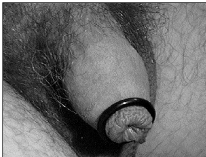
Sea anemone on display at the Camden Aquarium in New Jersey, equipped with "O-ring."