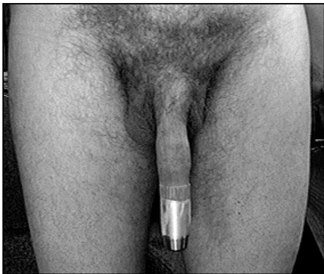
Pasty-white-guy equipped with PUD (Penis Uncircumcising Device).