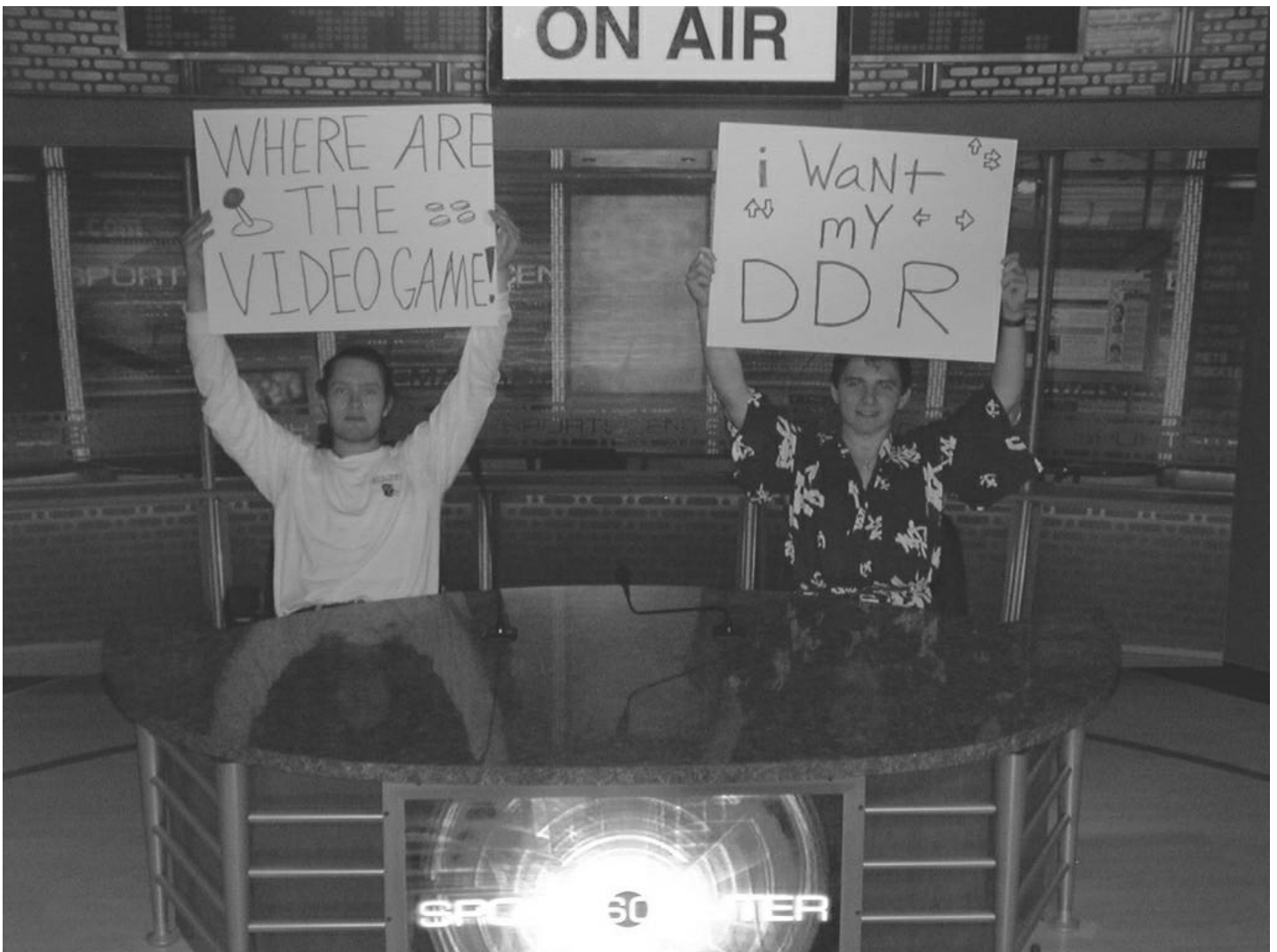
The RIT Beer and Nerd Club protests the Namco contract termination.